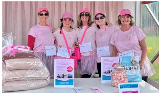
As part of a company wide movement several of the Harrisons Auckland team participated in Pink Ribbon Walk.